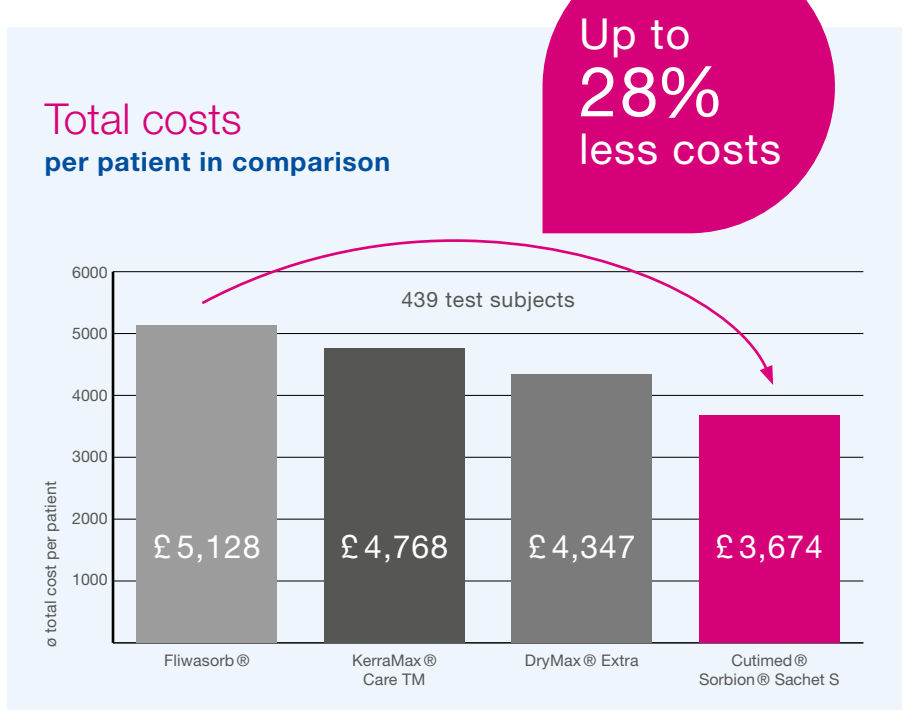
Table 2. Total cost of care per patient for the UK National Health Service in the treatment of venous leg ulcer over 6 months